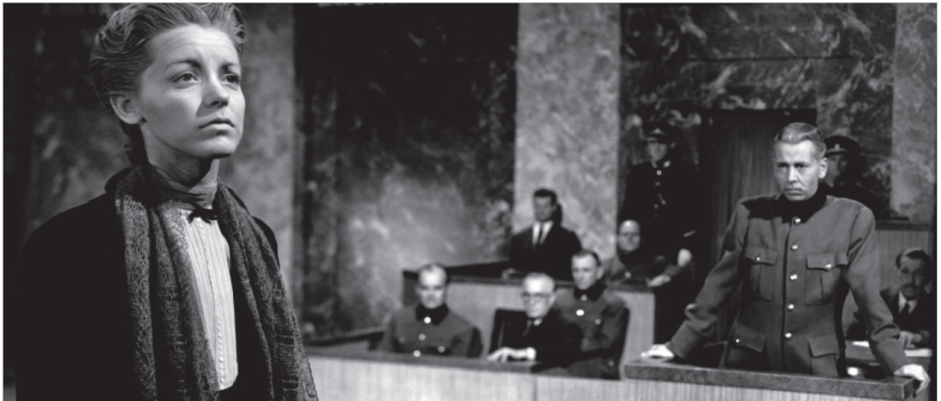
The only Hollywood wartime film to visualize the Holocaust, None Shall Escape (1944).

of references to Nazi persecution of Jews, the film's black humor turns somewhat sentimental in the final speech, given by the barber (who is mistaken for Hynkel) to the cheering masses. Both films were used by isolationist Senator Gerald Nye in Congressional hearings to prove that "the Jews of Hollywood are driving this nation to war."