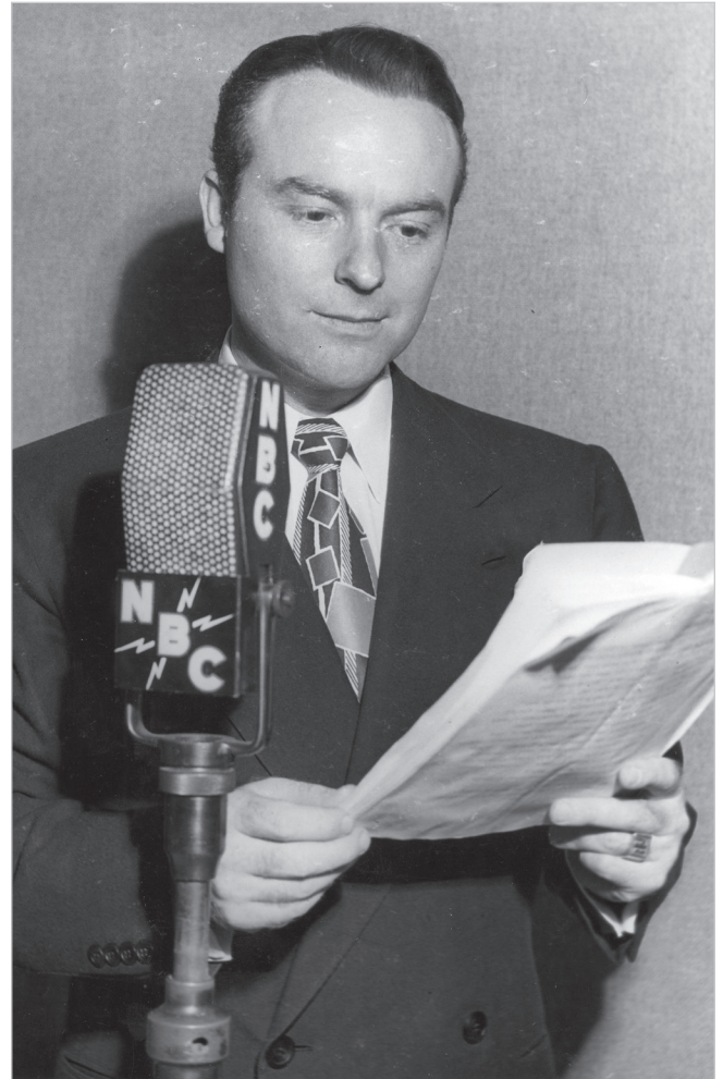
Ralph Edwards, creator, producer and host of This is Your Life .

The television series debuted on NBC in 1952 and quickly became an icon of popular culture. It aired weekly for the next nine years; syndicated shows, cable airings and